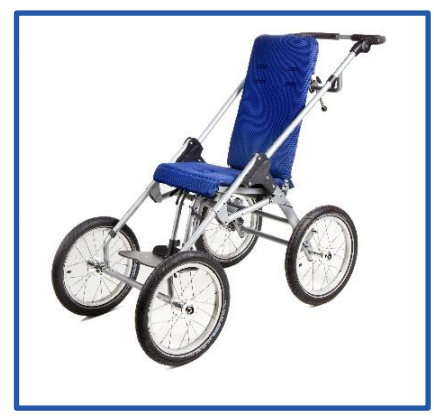
With seat frame, footrest and offroad set