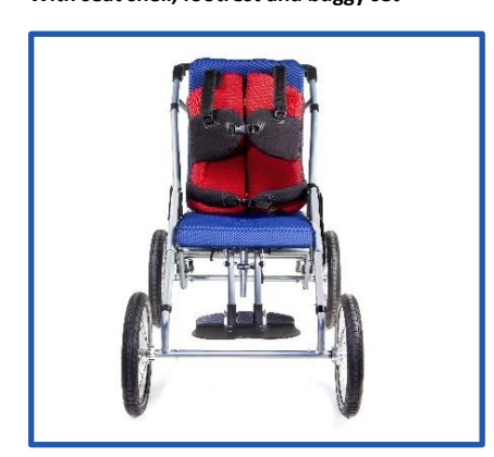
Also with corset