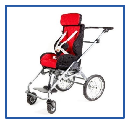
With car seat Tony Plus, footrest 2 and buggy set