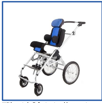
With seat shell, footrest and buggy set