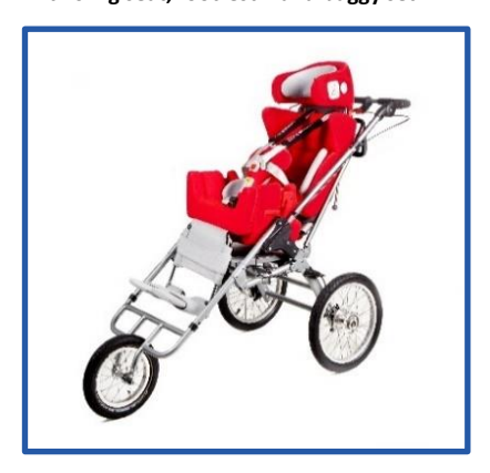
With car seat Carrot 3, footrest and jogger set