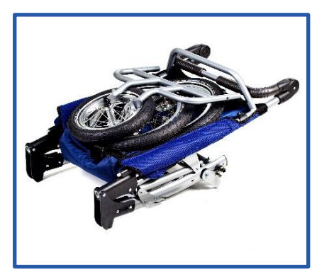
And folded the entire Multiroller is very small