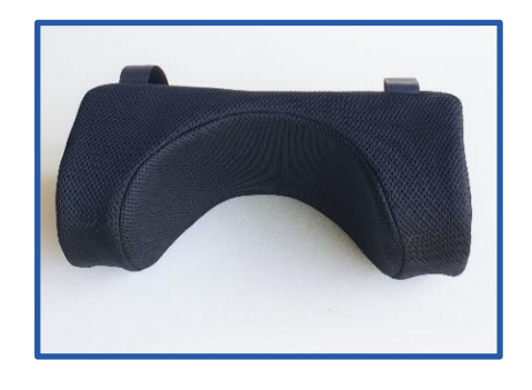
Example: head rest