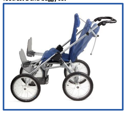
...in many positions