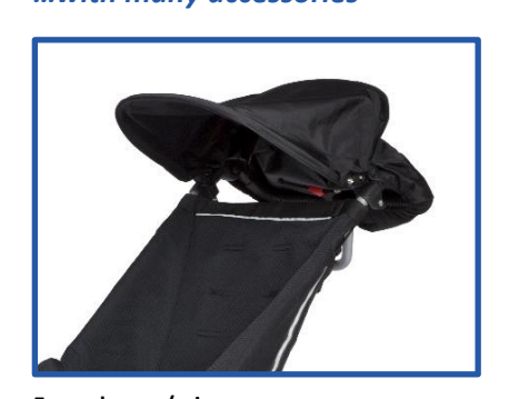
Example: sun/rain canopy