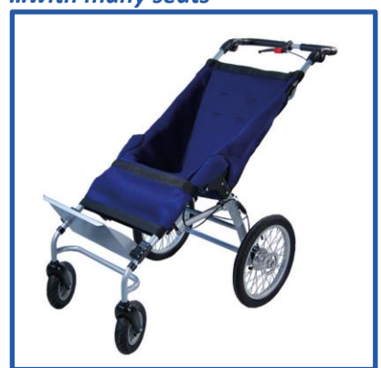
With sling seat, footrest 1 and buggy set